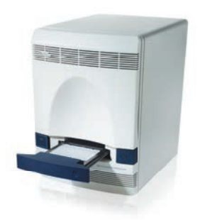
KingFisher Flex Purification Instrument